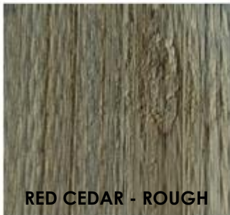
RED CEDAR - ROUGH