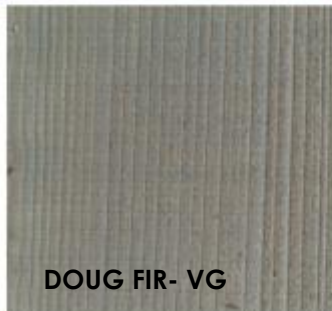
DOUG FIR- VG